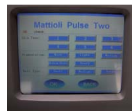
Simplified user interface for optimized treatment or parameters selections available