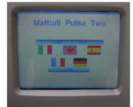
Touch Screen easy to see display for any user need and languages selection.