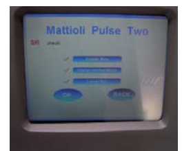
Real time Device control